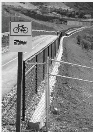
A completed section of the trail near the connection to the Bonneville Shoreline Trail

Parley's Trail is a model for urban trail-building efforts. In coming years, the groundwork laid by the PRATT Coalition will pave the way for a citywide trail system, and provide a critical link in a regional network of bicycle and pedestrian trails called the Wasatch Loop.