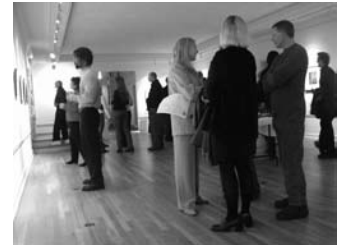
The Salt Lake City Arts Council / Finch Lane Gallery is a member of the Salt Lake Gallery Association.

For further information, please call the Salt Lake City Arts Council at 596-5000.