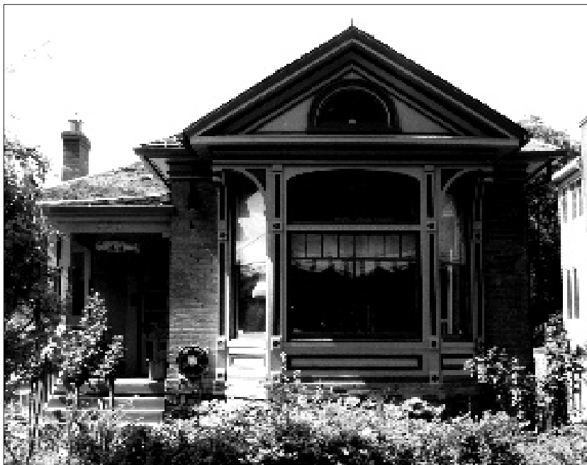
This Victorian Eclectic structure exemplifies the visual and architectural richness of buildings in the Capitol Hill district.

Despite the poor quality of the soil and the difficulty of obtaining water, Capitol Hill has always been a popular place to live. It was close to Main Street businesses and nearby manufacturing establishments, and yet was