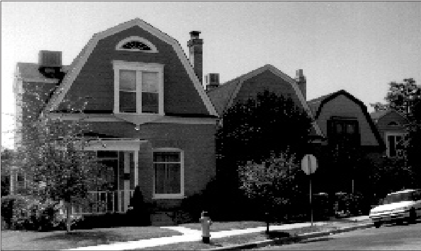
A row of Dutch Colonial structures angled with the street provides a distinct character to the streetscape of this block in the Capitol Hill district.

ambiance of the Marmalade district. Other modern buildings, particularly apartments, have detracted from the architectural integrity of the area, but not to the extent of the “twin towers.” Happily, about this time preservationists and “urban pioneers” began to invest in Capitol Hill by renovating historic homes. The small scale of the neighborhood, its close location to downtown, and its unique architectural resources — the very qualities that drove residents away earlier — now proved to be its biggest appeal. Today it is a vibrant neighborhood with many examples of successful renovation projects that have been sensitively restored.