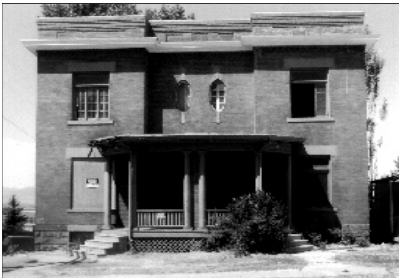
This classically-inspired duplex is an example of high style multifamily housing in Salt Lake City. A centrally located porch defines the entrance. This structure was extensively renovated in 1995.

Appropriate primary building materials include brick, stucco and painted wood.