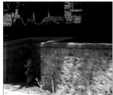
Retaining walls provide visual interest to the street, and serve as distinct character-defining features. This characteristic should be preserved.

Within the Capitol Hill district a wide range of architectural styles exists, which yields a variety of building forms. Perhaps what is the most distinctive feature of the Marmalade subdistrict is the profusion of dwellings of simple design and detailing and of modest scale. Although Arsenal Hill has examples of vernacular designs, it also has numerous Queen Anne and two-story box-style buildings.