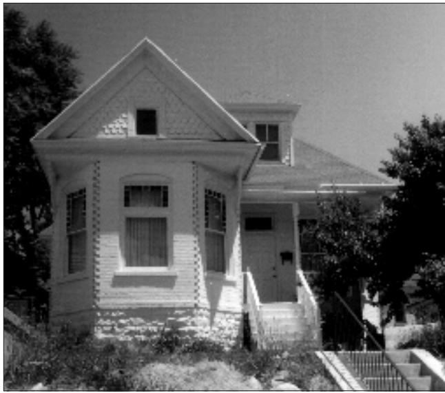
Decorative shingles in the gable, turned posts on the porch and the interlocking brick bay of this house exhibit the high degree of craftsmanship and attention to detail that mark many houses in the neighborhood.