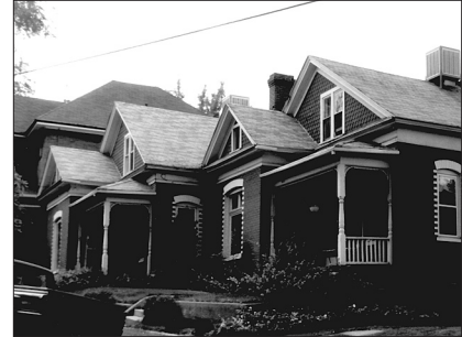
Staggered setbacks in the Marmalade district are due to its diagonal street pattern.

In Arsenal Hill, street patterns and lot lines call for more uniform setback and siting of primary structures. Historically, the Marmalade district developed irregular setbacks and lot shapes. Many homes were built toward compass points, with the street running at diagonals. This positioning, mixed with variations in slope, caused rows of staggered houses, each with limited views of the streetscape. Staggered setbacks are appropriate in this part of the district because of the historical development. Traditionally, smaller structures were located closer to the street, while larger ones tended to be set back further.