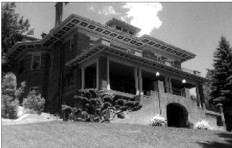
The "Woodruff-Riter-Stewart Home" at 93 East Second North Street is an example of the variety of architectural styles that can be found in the Capitol Hill Historic District.

Specific design standards that respond to the design character of the neighborhood follow on the next page.